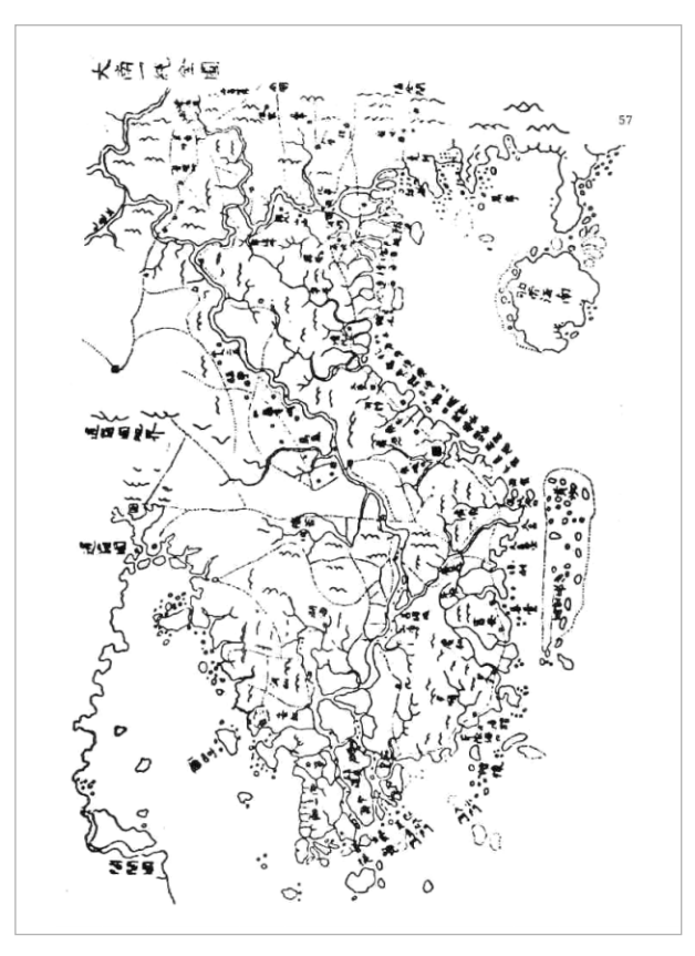
Map 1: Dai Nam Nhat Thong Toan Do (The Complete Map of the Unified Dai Nam of 1838)

Source: Dai Nam Nhat Thong Toan Do (The Complete Map of the Unified Dai Nam, Ministry of Foreign Affairs of the Socialist Republic of Vietnam, The Hoang Sa And Truong Sa Archipelagoes Vietnamese Territories (1981) [Vietnam White Paper 1981], at 19. See also http://biengioilanhtho.gov.vn/eng/Album. aspx (last visited on Apr. 1, 2012).